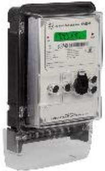
Electrical Energy Monitoring